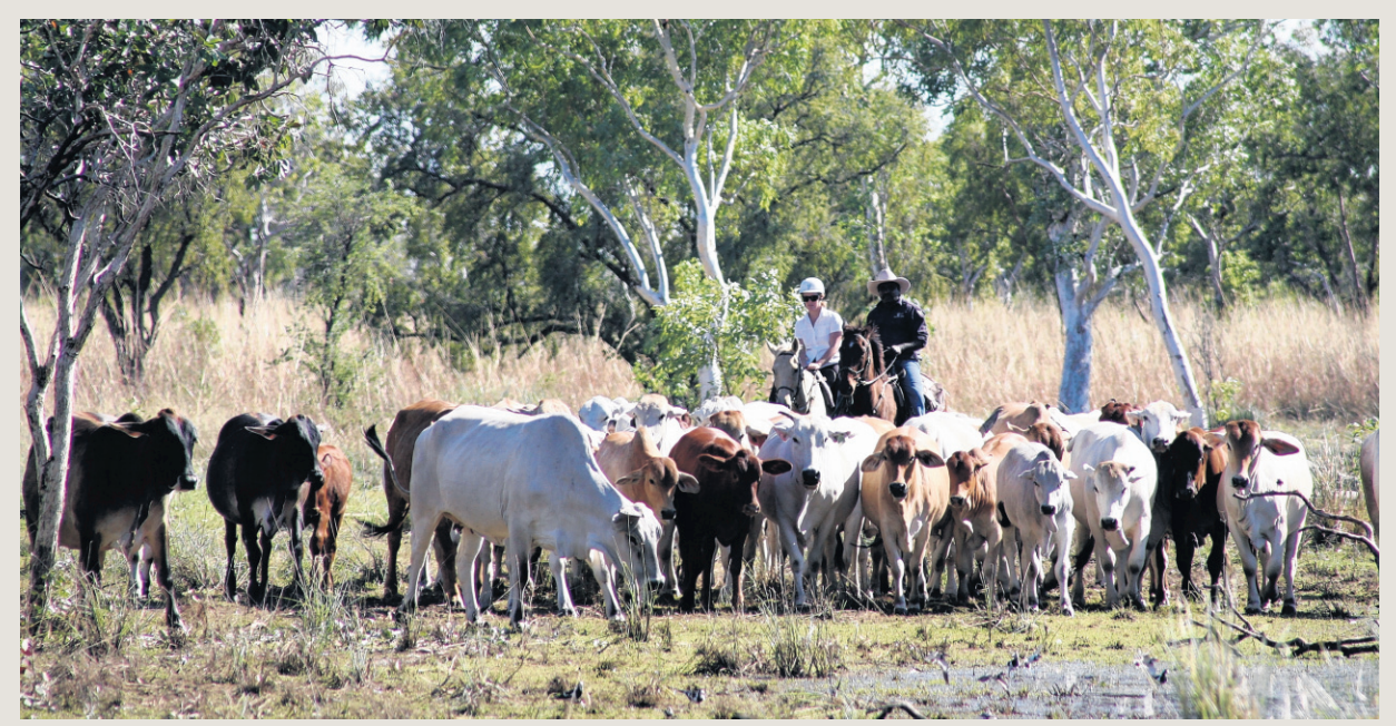
Ready to go droving at Home Valley Station.